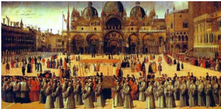
Gentile Bellini Procession in St. Marks Square 1496